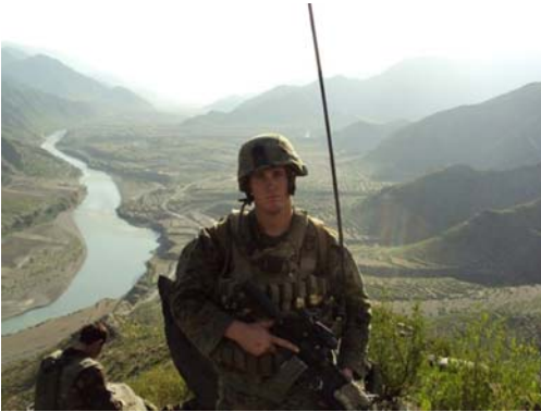
Cpl. Dakota Meyer

Former Marine corporal to receive Medal of Honor