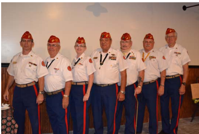
2011 – 2012 Marine Corps League Officers