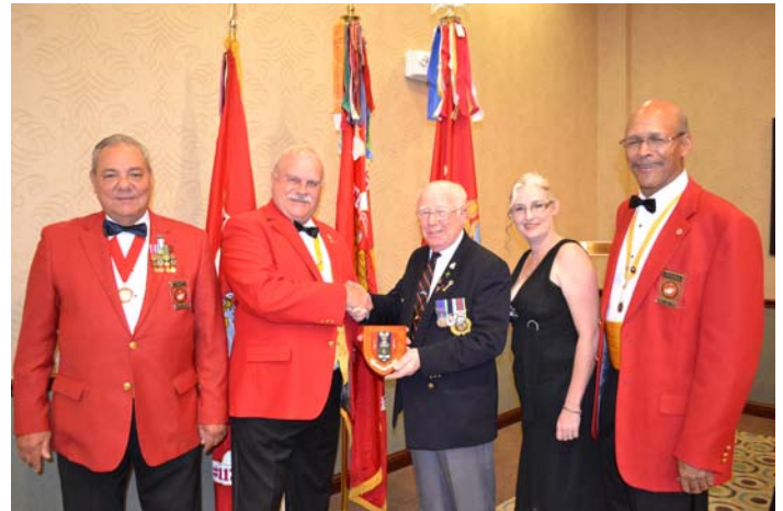
Plaque Presentation at the S.E. Division Conference

It is a privilege and honor to be an associate member of the USMC league Riverview detachment.