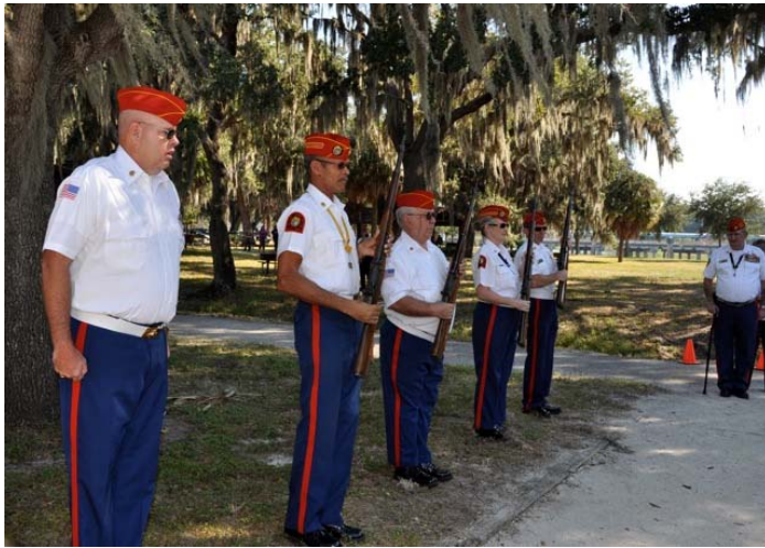
Rifle Guard from Field of Honor on 10/9/10