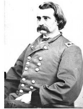
General John Logan

in Gen Logan giving his official proclamation in 1868. It is not important who was the very first, what is important is that Memorial Day was established. Memorial Day is not about division. It is about reconciliation; it is about coming together to honor those who gave they're all.