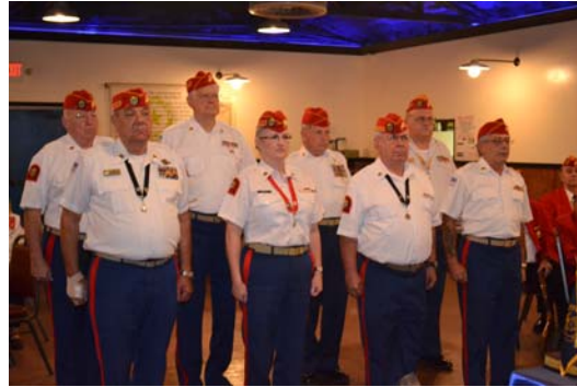
Congrats to the 2012 Officers

departed the Bay of Bengal off the coast of Bangladesh after nearly two weeks of disaster relief operations following a devastating cyclone. The joint task force delivered tons of relief supplies using helicopters, C-130s, and landing craft in Operation Sea Angel.